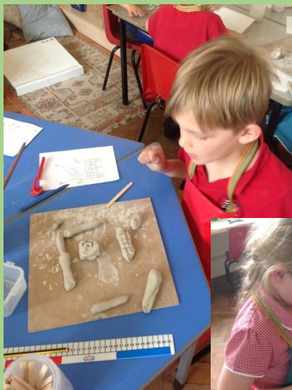
Making clay aliens - Y2