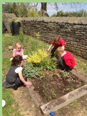
Rec / Y1 Gardening in the sun